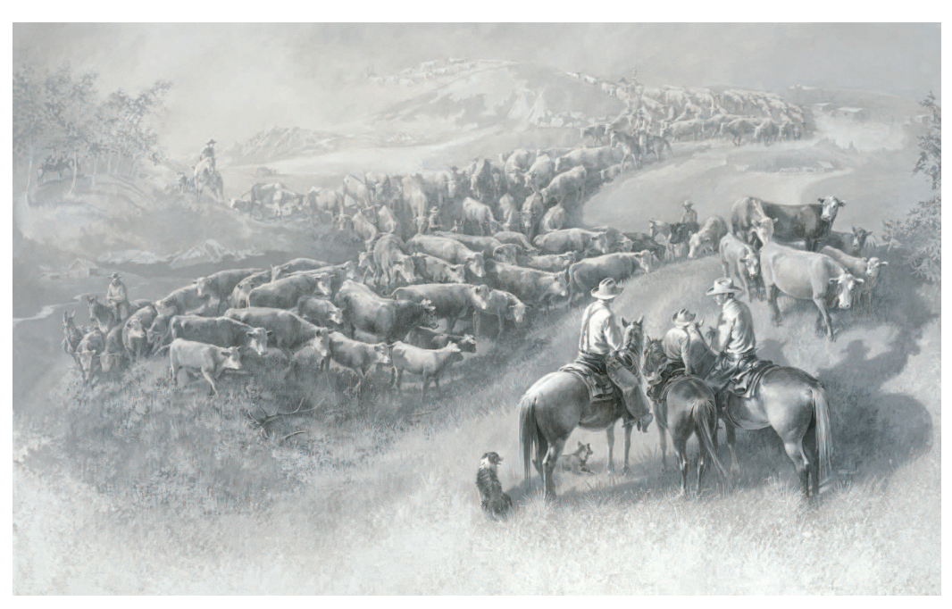
The "For Many Generations to Come" mural is on permanent display at the Gunnison Airport.

patches of mountain brome and legumes. "Preserving biodiversity is one of the major components of our annual grazing plan with the United States Forest Service."